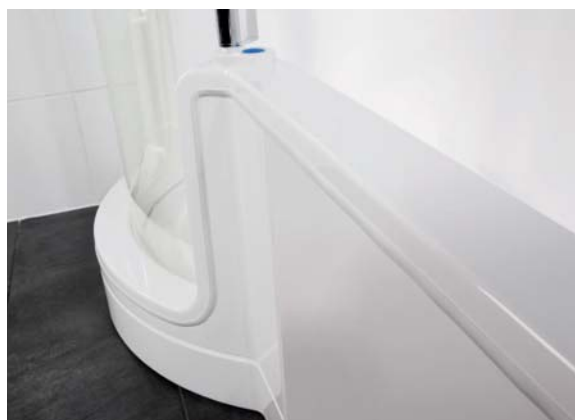
Joint moulding to cover the skirt gap